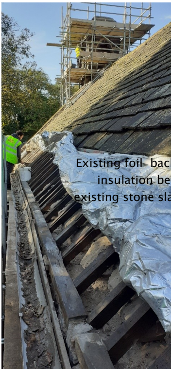
Existing foil backed insulation below existing stone slates