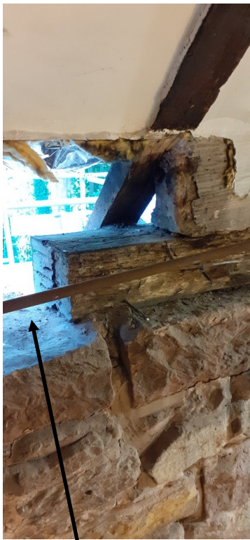
Missing inner wall plate (previous rot?)