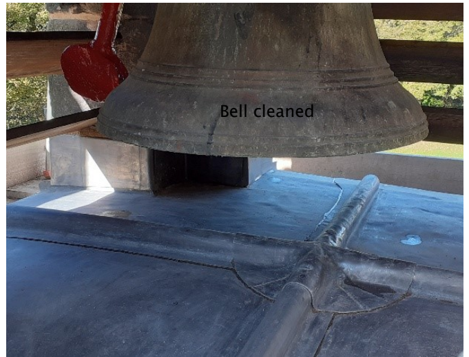
Bell frame / metalwork treated and painted to match existing