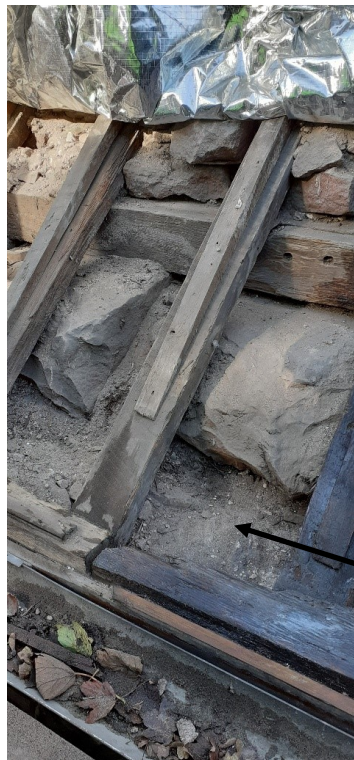
Wall head cleared of rubble infill