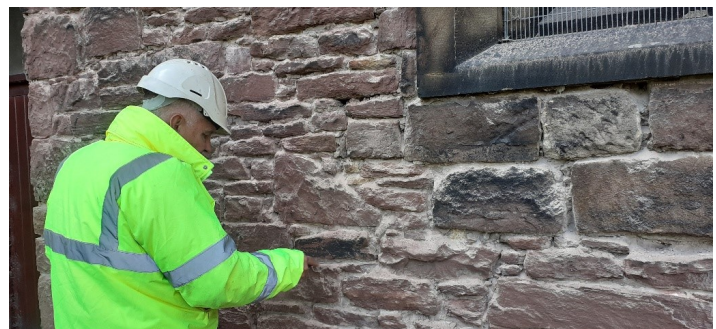
Raking out cement mortar—east wall

Progress Photographs dated 21st October 2021