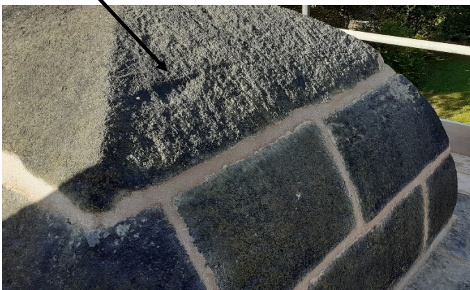
Top of bellcote repaired and repointed—repointing proceeding at lower levels.