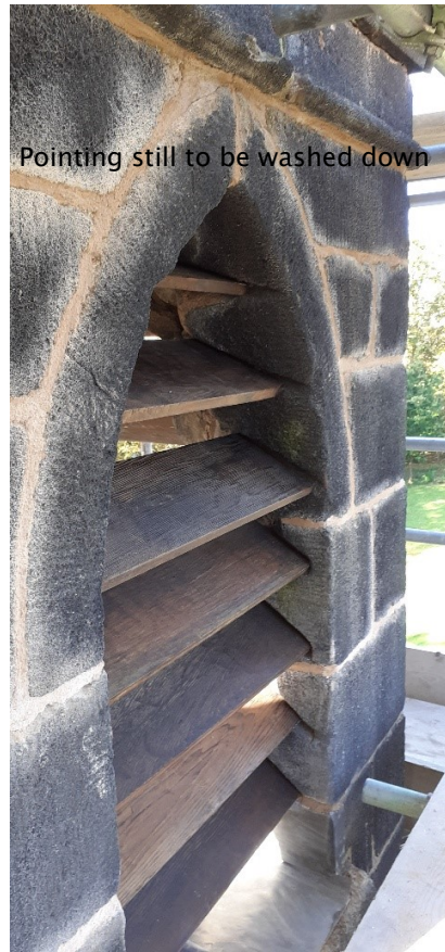
Existing louvres oiled and reinstated