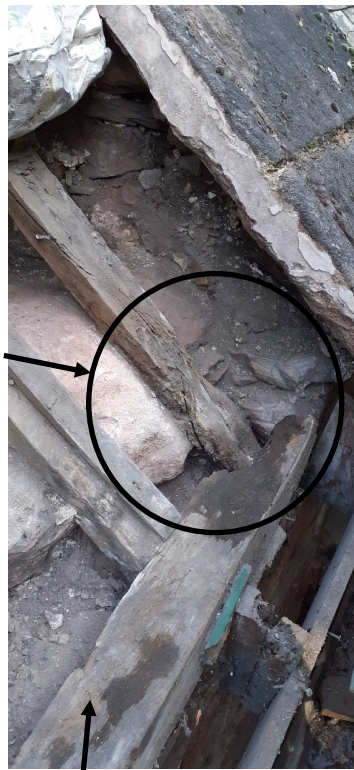
Outer wall plate