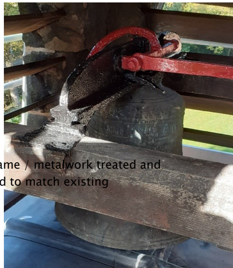
Bell frame / metalwork treated and painted to match existing