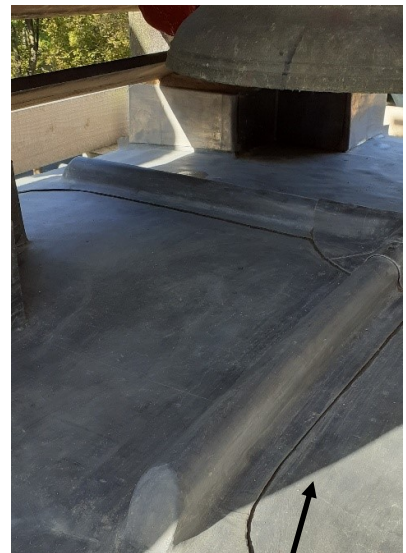
Base of bell chamber—void filled with masonry, screeded and new lead covering installed (all rotten timber scrapped)